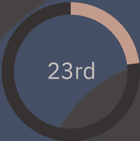
Global Export Ranking By export value worldwide